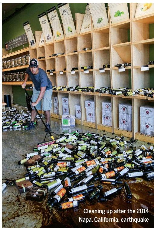
Cleaning up after the 2014 Napa, California, earthquake

Proc. Natl. Acad. Sci. U.S.A. 10.1073/pnas.1403053111 (2014).