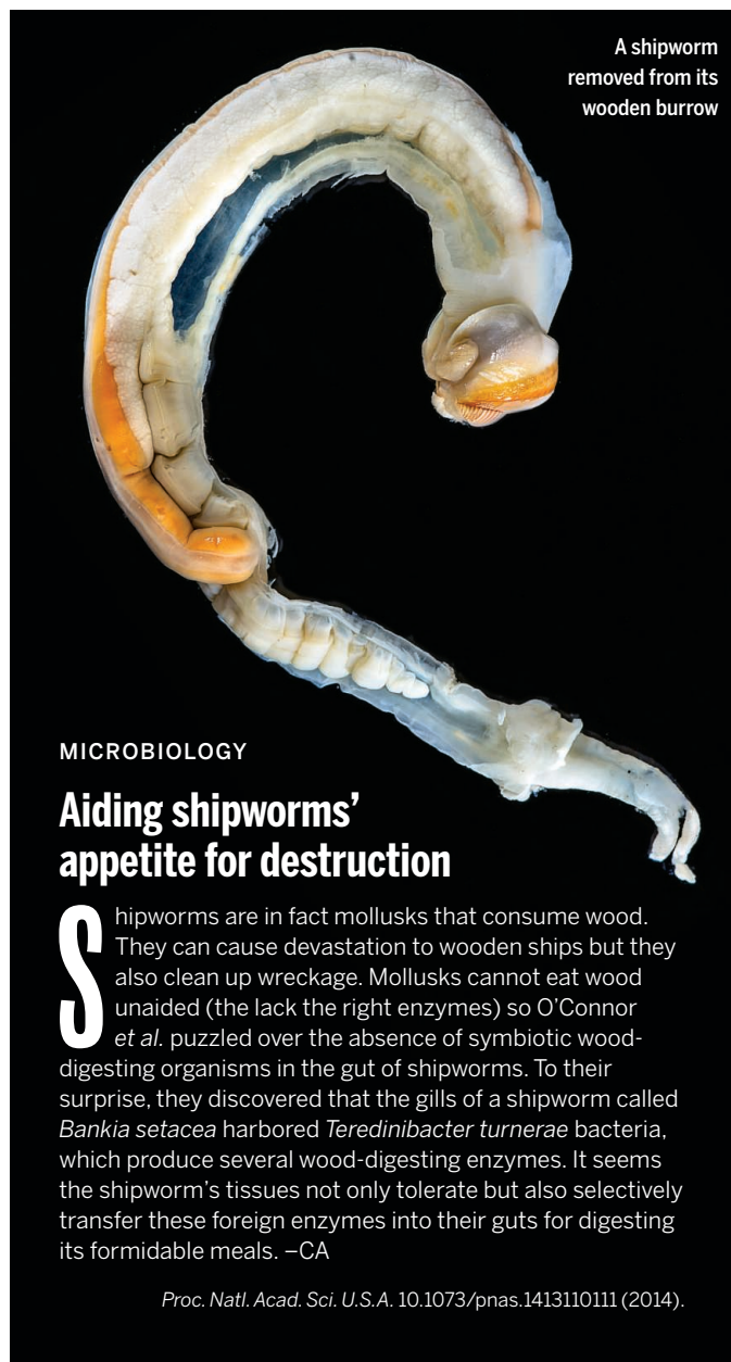
A shipworm removed from its wooden burrow